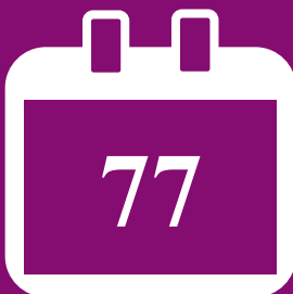
LIFE EXPECTANCY AT BIRTH

Health insurance coverage helps children achieve and maintain their best health. 1 in 10 Yancey children (10.4%) is uninsured, 352 of whom may be income eligible for Medicaid or NC Health Choice.