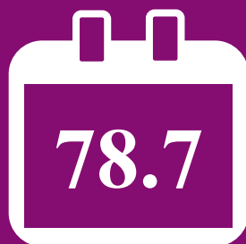
LIFE EXPECTANCY AT BIRTH

Health insurance coverage helps children achieve and maintain their best health. 1 in 16 Washington children (6.1%) is uninsured, 187 of whom may be income eligible for Medicaid or NC Health Choice.